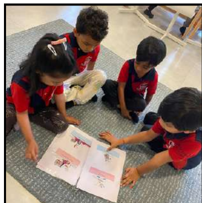
PreK - 4B

Its productive and engaging day in the classroom. Students are hitting key developmental milestones across several core subjects. Students are drawing landforms they've learnt about during their UOI lesson. Students are working on teen number puzzle. Students are blending sounds to read and write CVC words. Students are working on Sight words covered so far and practicing them. Students are reading CVC fluency passages.