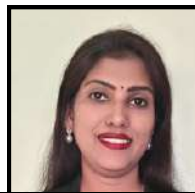
VP - HIMABINDU

Hey NYA Families! Get ready to zoom into an action-packed February.